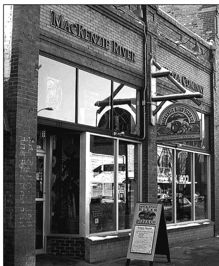
F MacKenzie River Pizza Co. 232 E. Main, in Historic Downtown Bozeman. 587-0055 See photo in previous column.

their Regional American Cuisine. Their menu consists of hand cut steaks, fresh seafood, wild game and pasta. Compliment your meal with their offerings from a full service bar and extensive wine list. Their wine list has received the Wine Spectator's Award of Excellence. Boodles' atmosphere is casual and the service is attentive. They provide a non-smoking atmosphere until 10 p.m. Enjoy lunch Mon. through Sat. Dinner is offered seven nights a week and the bar is open nightly until 2 a.m. Reservations are suggested at Boodles.