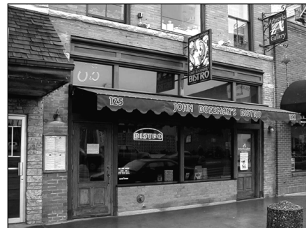
F John Bozeman's Bistro 125 W. Main, Downtown Bozeman. 587-4100