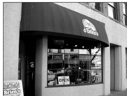
F O'Brien's 312 E. Main, Historic Downtown Bozeman. 587-3973

Famous for gourmet pizzas, super sandwiches and extraordinary salads, everything is made fresh daily right down to the salad dressings and the pizza dough! Established in 1993 and located in historic downtown Bozeman, this is the original store that launched the spread across the state.